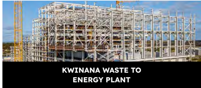
KWINANA WASTE TO ENERGY PLANT

To view more of our projects, please visit our website www.paragonscaffolding.com.au