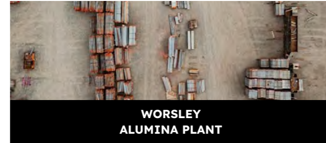
WORSLEY ALUMINA PLANT

Solutions: Scaffold management | Falsework | Cranable stair access | Edge protection | Scaffold design | Engineering | Trucks | Adhoc other supply