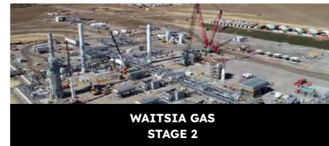
WAITSIA GAS STAGE 2

Solutions: Scaffold management | Falsework | Cranable stair access | Edge protection | Scaffold design | Engineering and 3rd party onsite sign-offs | 1m lift process