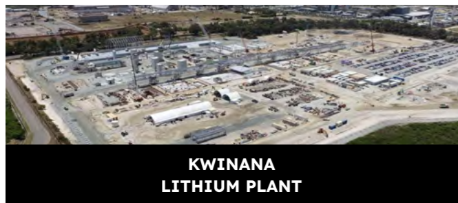
KWINANA LITHIUM PLANT

Solutions: Scaffold management | Labour | Design and engineering | Scaffold equipment | Plant hire | Falsework | Skylotec Height Safety Equipment