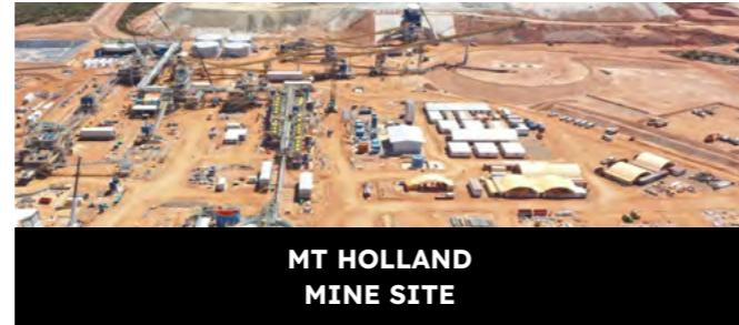
MT HOLLAND MINE SITE

Solutions: Scaffold management | Labour (scaffolders and riggers, yardmen, inspectors) | Material supply | Design and engineering | Boiler scaffold | Falsework | Layher FW Gantry | Temporary Roofs | Propping | Plant hire | Skylotec Height Safety Equipment