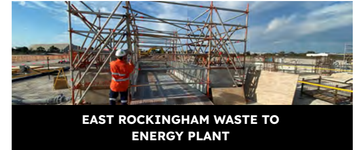
EAST ROCKINGHAM WASTE TO ENERGY PLANT

Solutions: Scaffold equipment | Labour hire | Design and engineering | Bridges | Loading platforms | Calsiner scaffolds | Skylotec Height Safety Equipment