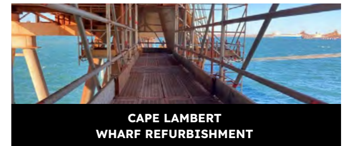
CAPE LAMBERT WHARF REFURBISHMENT

Solutions: Dry hire | Shoring | Public access scaffold | Cranables | Scaffold design and engineering